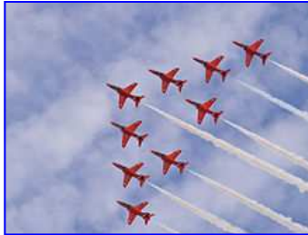
"Diamond Nine" formation