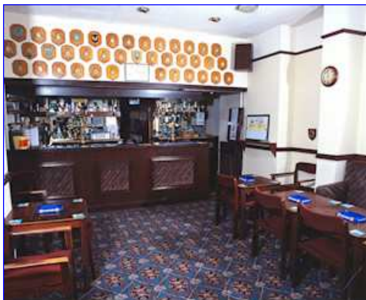
Hands up if you remember this watering hole somewhere in Gloucester.