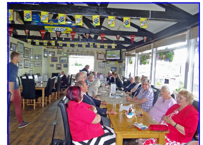
Members enjoying lunch at the Aviator Restaurant on Armed Forces Day.