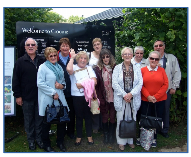
Croome Court, Sept 2017