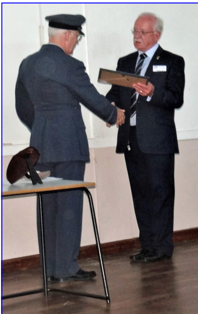
Adoption Certificate presented by our Branch Chairman.

This year 181 (City of Gloucester) ATC Squadron become the first squadron to be adopted by our branch. Adoption certificates are given to those ATC squadrons that work in partnership with RAF Association branches providing mutual support and assistance when needed.