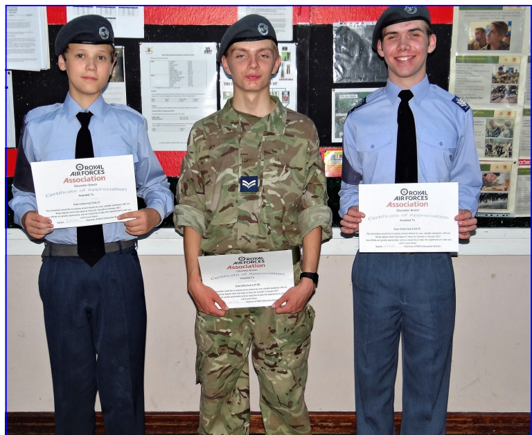
Three of the cadets presented with Wings collection appreciation certificates