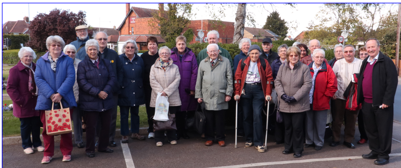
Branch members and St John's Church congregation visit to the National Arboretum.