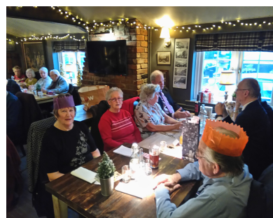
Christmas Lunch 2018