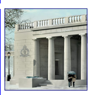
Christmas cards available from the RAFBF.

The squadron has cadet members from all over the city and have over 30 cadets on role. The cadets enjoy a wide range of activities including flying, gliding, shooting, Duke of Edinburgh's award and model making as well as the opportunity to progress through classification exams and develop leadership skills through cadet NCO ranks within the structure of a uniformed cadet force.